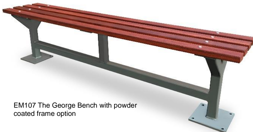
EM107 The George Bench with powder coated frame option