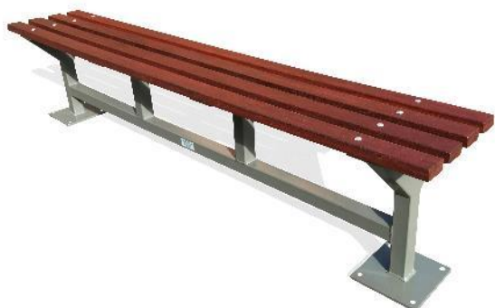
EM107 The George Bench with powder coated frame and 2m length option