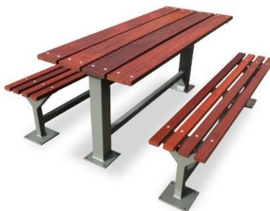
EM050 The George Setting with powder coated frame option